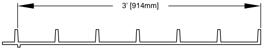
PLAN VIEW OF PFI-36X12 PANEL